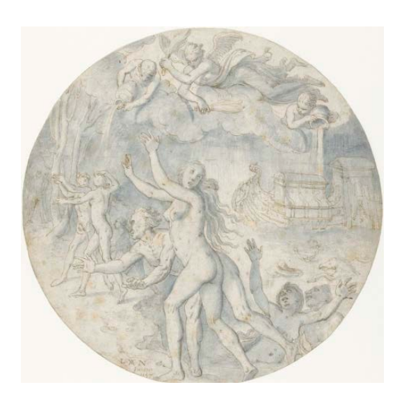
Fig.1 Lambert van Noort (1520-The Flood (De Zondvloed) 26.5 cm diameter; drawing in ink and brush on paper Amsterdam, Rijksmuseum, inv.RP-T-1919-54

A violent, frenetic battle scene unfolds in a high rocky landscape. At the centre of the action a long-haired soldier clad in plate armour drags a crowned rider from his bucking steed, while another figure at far left takes control of the horse's reigns and grabs at its snout. Perhaps in response to the demise of their leader, a dense throng of combatants flee to the left, chased by mounted archers and cavalrymen armed with lances who ride into the scene from the right at full pelt. The routed army is overhung by a fluttering banner held aloft by one of its fleeing soldiers, its fabric emblazoned with a pair of crossed, ragged staffs against a striped field. Much of the shading and contouring of the figures was achieved through the application of washes of pigment, which lend the forms a smooth, silken appearance only occasionally broken up by scratched highlights. As is typical, silver stain is used to add touches of yellow to the scene, but unlike most of the other roundels in this catalogue, this technique takes second place to the far more dominant colouring provided by what is known as 'sanguine' pigment (due to its rich red hue), a development in glass-painting technology that emerged around 1500 in the Southern Netherlands and northern France.