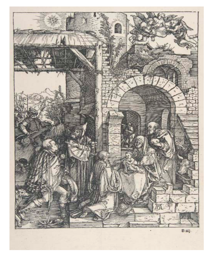
Fig.1 Albrecht Dürer The Adoration of the Magi, from the Life of the Virgin series c.1502 woodcut