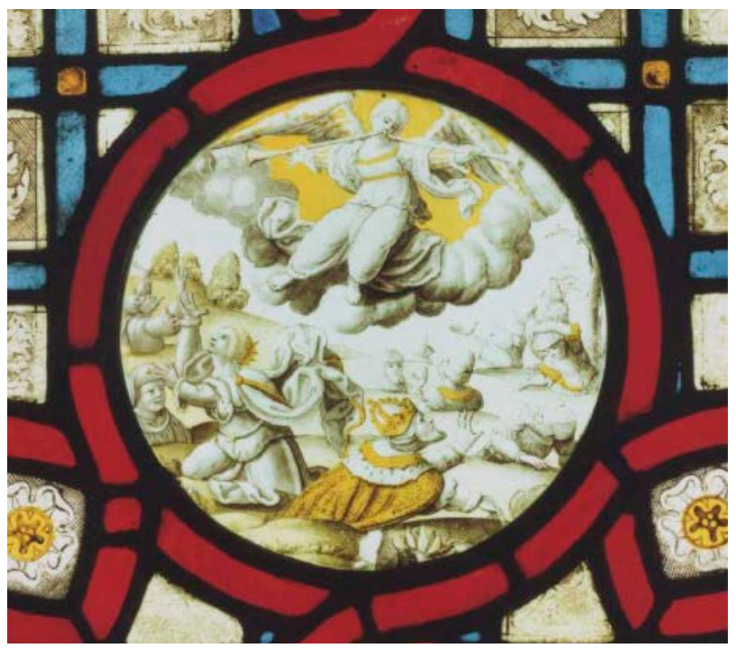
Fig.1 The Last Judgment Southern Low Countries c.1525 22 cm diameter; clear glass with silver stain and vitreous paint Berwick-upon-Tweed, Church of the Holy Trinity

The ornate details of dress inflecting our roundel with its high Mannerist slant serve to date it into the late 1520s or early 1530s. It is highly likely that it was produced in the same workshop as a Last Judgment roundel which uses the same inventive and expansive compositional formula, now in the church of the Holy Trinity at Berwick-upon-Tweed (fig.1). Details such as the delicate application of pink sanguine pigment, which is utilised both to breathe life into the blindfolded face of Venus, and to simulate the spurts of blood from Thisbe's chest as she falls on to her lover's sword, indicate a level of care and meticulousness far above the routine. Similarly refined is the use of the sgraffito or stick-lighting technique whereby the point of a hard implement was scratched back through the enamel before it was fused to the glass in order to pick out fine highlights in the design, such as the hemlines of clothing and the edges of leaves.