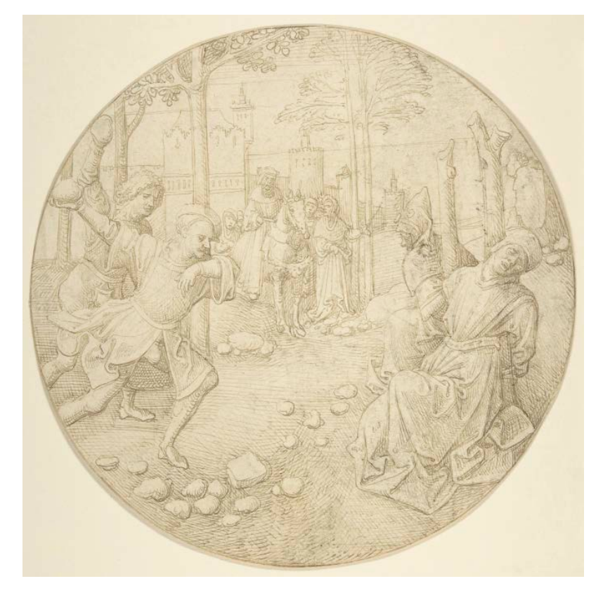
Pseudo-Aert Ortkens The Stoning of the Elders Early 16th century 22.2 cm diameter; pen and brown ink New York, Metropolitan Museum of Art, inv.2000.17

Alongside its compositional and technical details, a Brabantine origin might well explain our roundel's iconographic program too. Brussels, Mechelen and Leuven, all situated in close geographical proximity to one another, were home to important confraternities of crossbowmen, self-styled in each case as the Guild of Saint George, and it is intriguing to imagine the possibility that our roundel was produced in connection with