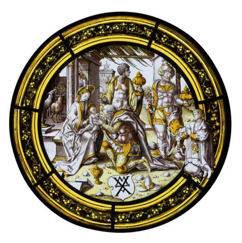
Fig.5 The Adoration of the Magi Antwerp? c.1530s 25.5 cm (35.5 cm with border); clear glass with silver stain and vitreous paint Amsterdam, Rijksmuseum

of the early sixteenth century rarely attain a level of quality comparable to those produced in the more developed and refined workshops of the Low Countries in the same period, and since ours are among the finest of their type to have survived, it stands to reason that they are more likely to have been executed by a Flemish glass painter drawing on a workshop stock of patterns that included southern German print sources, than a German glazier looking to Brabant and Flanders for inspiration.