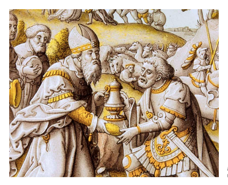
Melchizedek and Abraham (detail), cat.26 p.85