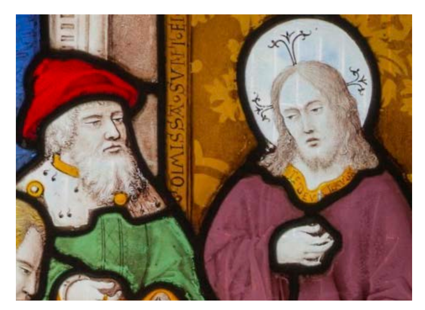
Fig.1 Jan Rombouts or his circle Christ at the House of Simon the Pharisee (detail) c.1520s clear, red, green, blue and purple glass with silver stain and vitreous paint Wales, Church of St Gwenllwyfo, Llanwenllwyfo