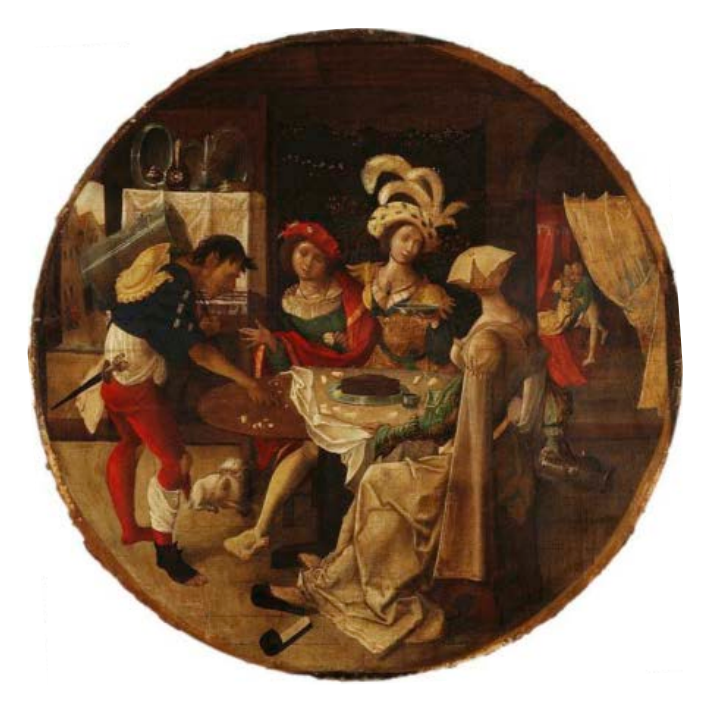
Fig.2 Sorgheloos and Lichte Fortune Low Countries c.1520 Distemper on linen Öffentliche Kunstsammlung Basel, Kunstmuseum