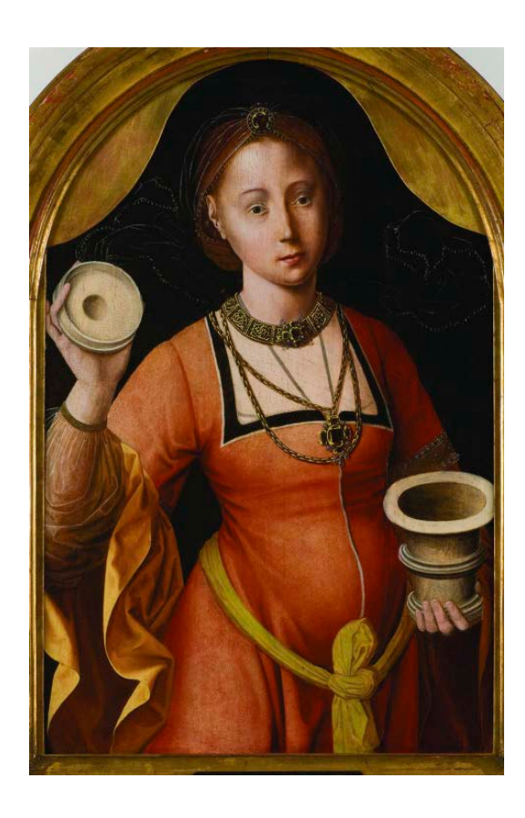
Fig.1 Master of the Mansi Magdalene Saint Mary Magdalene 56 × 37.3 cm; Oil on panel New York, Private collection

certainly designed in collaboration with a contemporary panel painter such as the Master of the Mansi Magdalen or a member of his circle. The remarkable refinement of its delicate hatched and painted shadows, and the virtuosic control of the sgraffito marks used to suggest highlights catching the folds of the robes and the contours of the neck and facial features, mark our glass painter out as an absolute master.