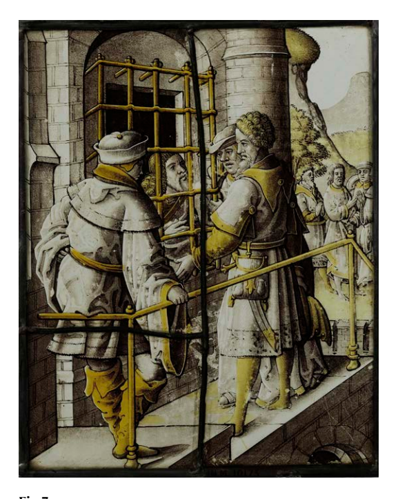
John the Baptist visited in prison Northern Netherlands c.1520s 23 × 18.5 cm; clear glass with silver stain and vitreous paint Amsterdam, Rijksmuseum, inv.BK-NM-2720

1, Timothy B. Husband, The Luminous Image: Painted Glass Roundels in the Lowlands , 1480-1560, Exh. cat., New York, Metropolitan Museum of Art, 1995, p.98 ff. 2, Husband 1995, cat. no.40 and pl.10.