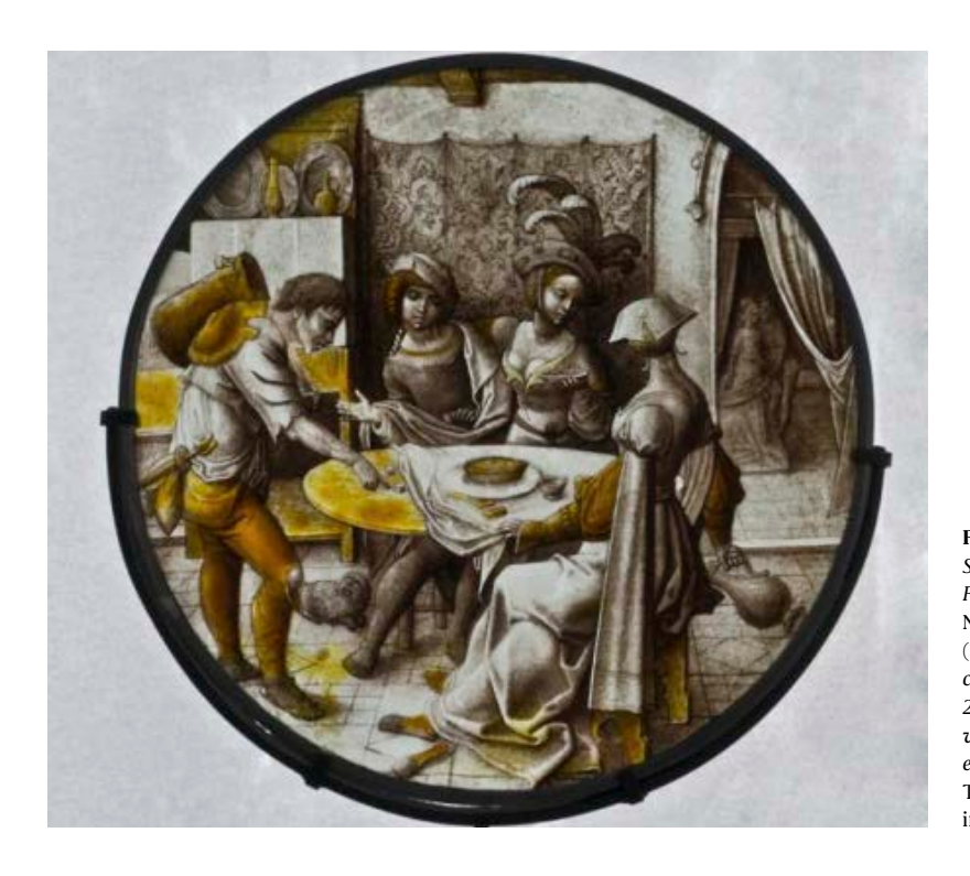
Sorgheloos and Lichte Fortune North Netherlands, Leiden (?) c.1520 27 cm diameter; clear glass with silver stain and vitreous enamel The Toledo Museum of Art, inv.57.49